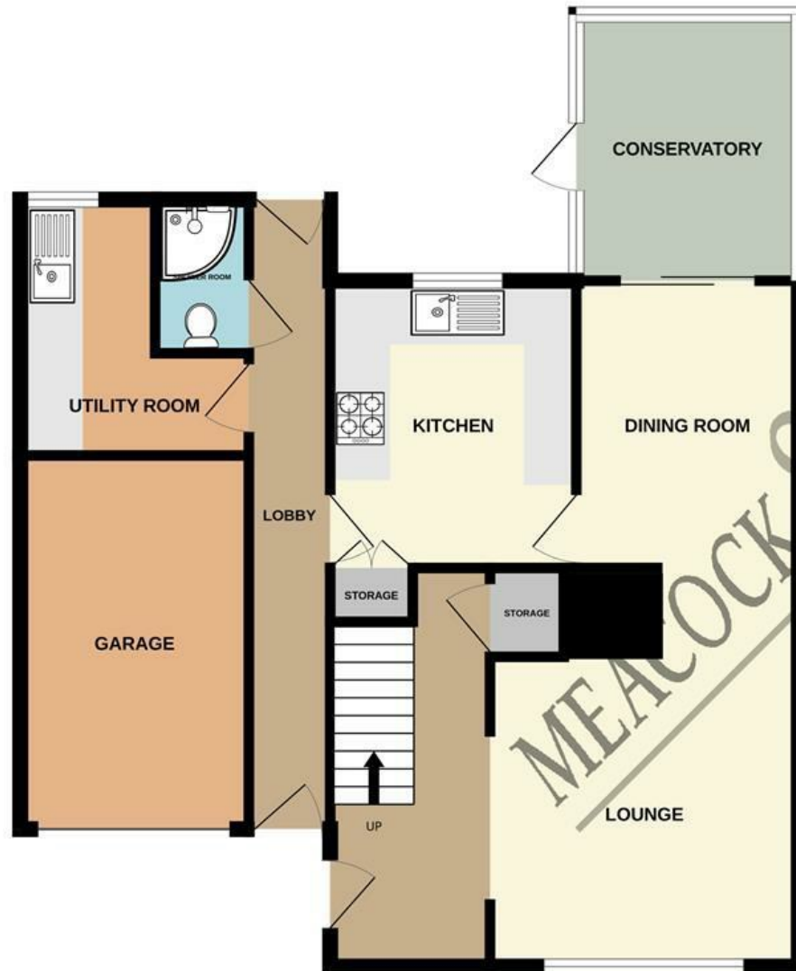
GROUND FLOOR 774 sq.ft. (71.9 sq.m.) approx.